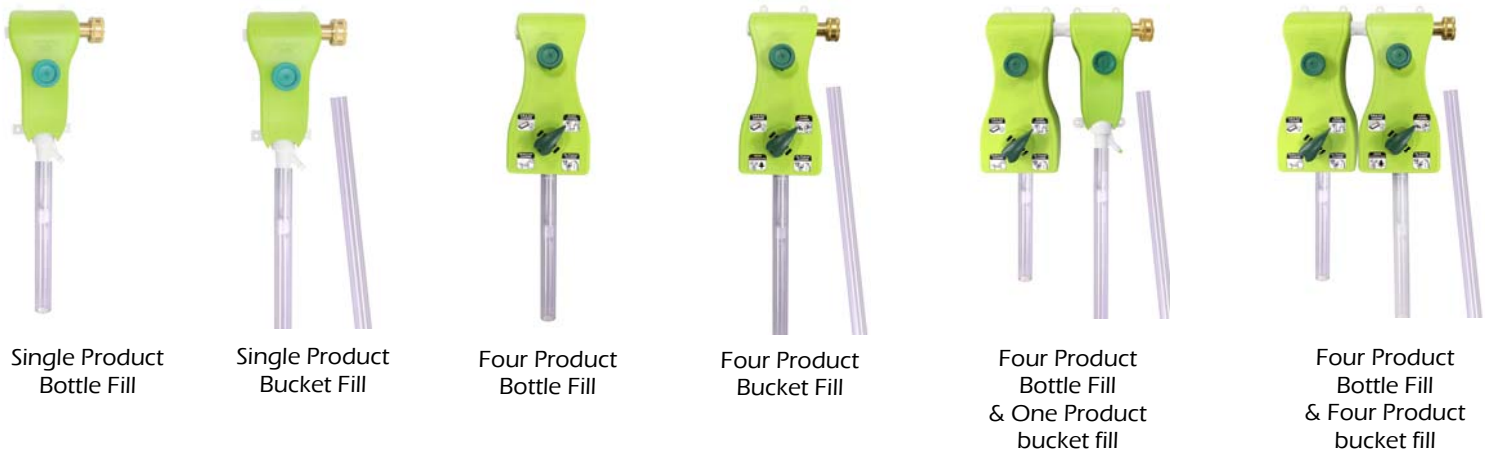
Single Product Bottle Fill

The MX Hospitality line offers a full line of models and configurations. Whether you need to dispense one chemical or if you need to dispense eight chemicals in bottle, bucket, or a combination of the two, the MX Hospitality has a unit that fits your needs. With its modular capabilities and common configurable parts, inventory and service parts is minimized.