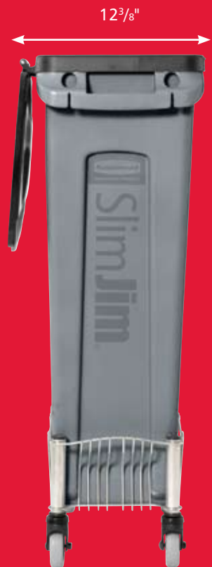
Slim Jim® with Hinge Lid and Stainless Steel Dolly

Molded-in handles, form-fitting stainless steel dolly, and sleek lid options improve Slim Jim's® functionality while maintaining its slim profile.