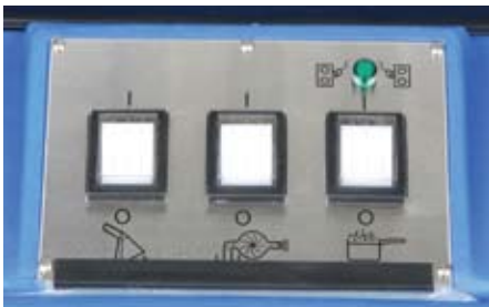
Lighted rocker switches with sealed switch plate and switches